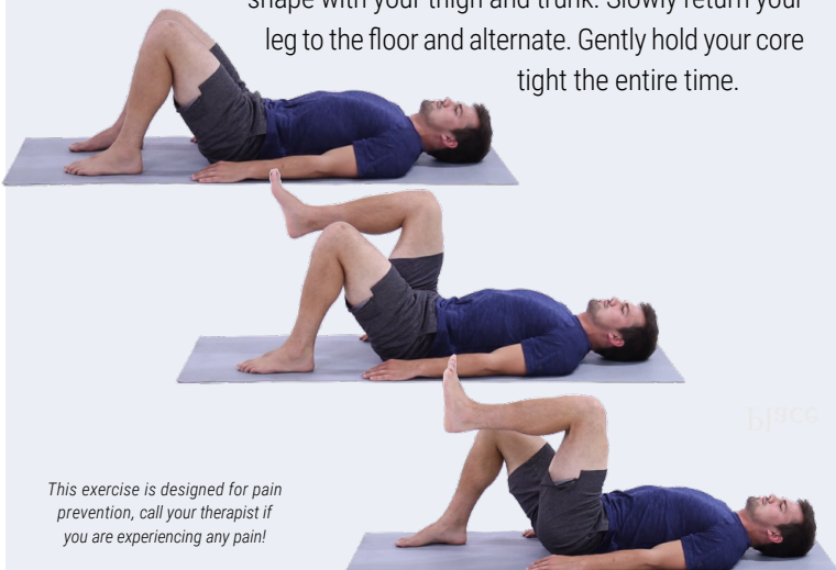
This exercise is designed for pain prevention, call your therapist if you are experiencing any pain!

Start on your back. Bend both knees and place your feet flat on the ground. Gently tighten your core and bring one leg up to make an 'L' shape with your thigh and trunk. Slowly return your leg to the floor and alternate. Gently hold your core tight the entire time.